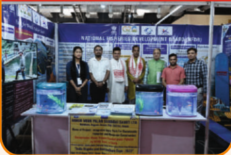
NFDB, GOVT. OF INDIA