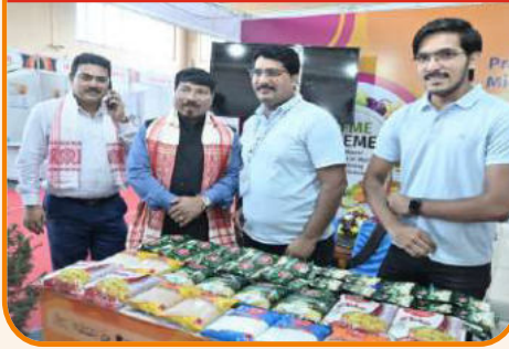
AIDC LTD., GOVT. OF ASSAM