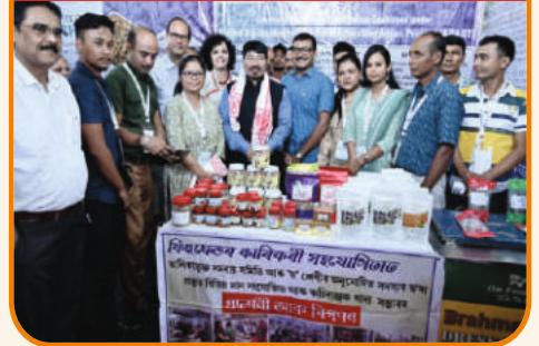
DIRECTORATE OF FISHERIES, ASSAM