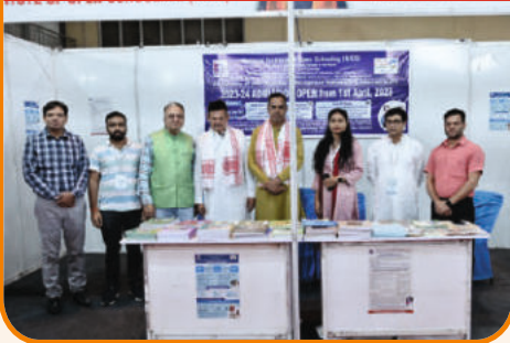
NIOS, GOVT. OF INDIA