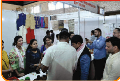
KVIC, GOVT. OF INDIA