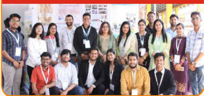
DELHI PHARMACEUTICAL SCIENCES AND RESEARCH UNIVERSITY