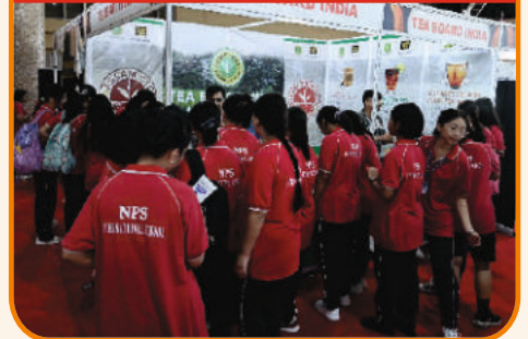
TEA BOARD INDIA