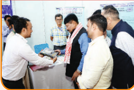
GSI, GOVT. OF INDIA