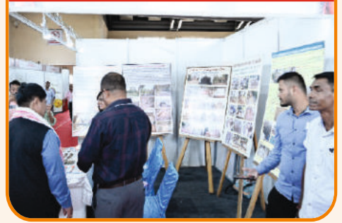
DIRECTORATE OF ARCHAEOLOGY, ASSAM